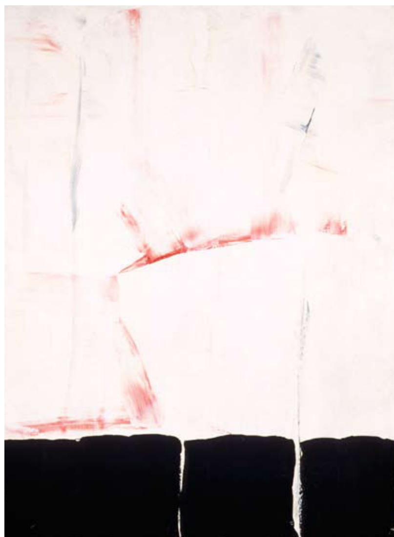
PAUL-ÉMILE BORDUAS, SANS TITRE (N° 39), 1958, OIL ON CANVAS, GIFT OF NATIONAL MUSEUMS OF CANADA. COLLECTION MUSÉE D'ART CONTEMPORAIN DE MONTRÉAL.