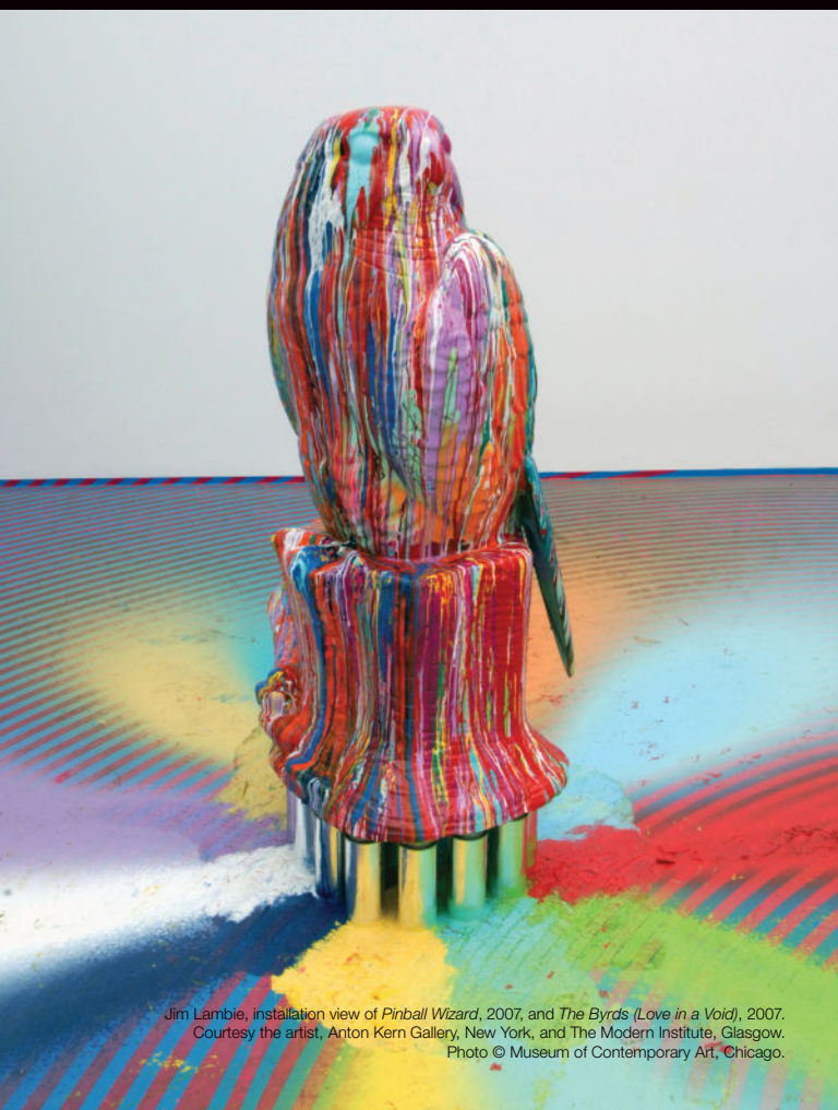
Jim Lambie, installation view of Pinball Wizard , 2007, and The Byrds (Love in a Void) , 2007. Courtesy the artist, Anton Kern Gallery, New York, and The Modern Institute, Glasgow. Photo © Museum of Contemporary Art, Chicago.