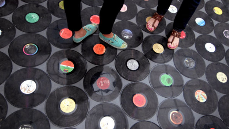
Installation view of Christian Marclay, Untitled , 2007 from the exhibition Sympathy for the Devil: Art and Rock and Roll Since 1967 .

The exhibition explores the interconnections that have developed between contemporary art and rock music over the last forty years. It comprises more than 130 works by nearly sixty artists and collectives, organized in six sections corresponding to the music scenes in New York, the United Kingdom, Continental Europe, the West Coast, the U.S. Midwest and the rest of the world.