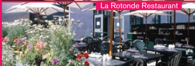
La Rotonde Restaurant