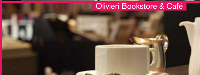
Olivieri Bookstore & Café