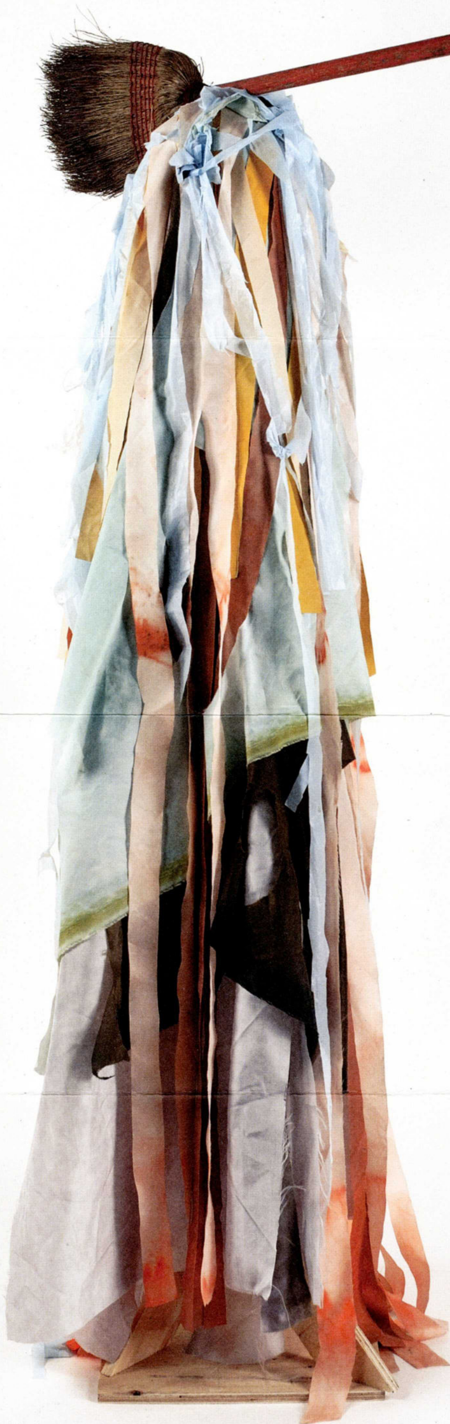
Geoffrey Farmer, I am by nature one and also many, dividing the single me into many, and even opposing them as great and small, light and dark, and in ten thousand other ways , 2001.